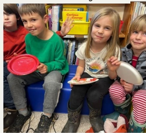
Empty plates and smiles