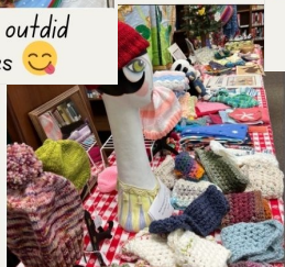
A great time to check out the crafts at the craft sale