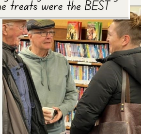
New and old friends