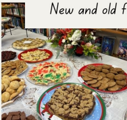
Our bakers outdid themselves 😊