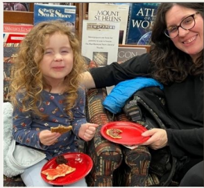
Library manager's little one says the treats were the BEST