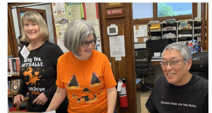
Meeting hosts having fun at the library

September 4, 2024 October 2, 2024 November 6, 2024 February 5, 2025 March 5, 2025 May 7, 2025